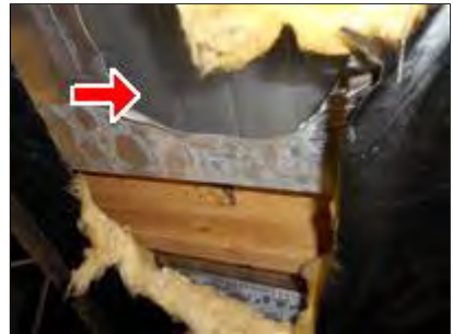
8.1 Picture 3