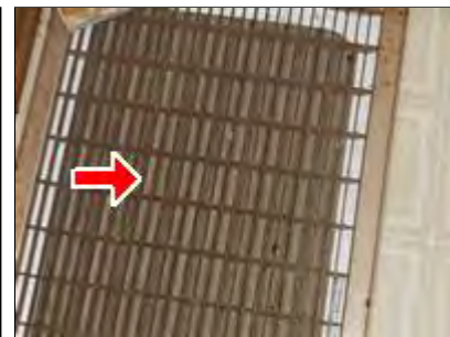
7.3 Picture 2

(2) There is duct tape that is pulling loose at the main duct in the crawlspace. This may lead to lose of heat or cold air. Have the duct properly sealed by a qualified person.