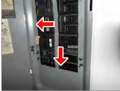
6.1 Picture 2

(2) The panel cover does not fit securely to the panel box. The trim is holding the cover away from the panel box, leaving gaps at the breakers. Have the trim notched to allow the cover to fit securely against the box.