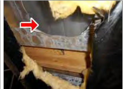
8.1 Picture 3