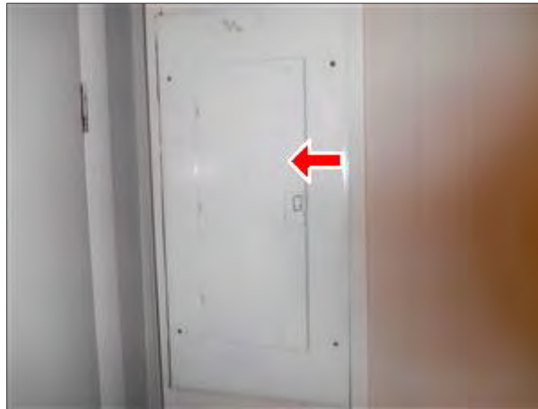
6.6 Picture 1

The main panel box is located at the bedroom.