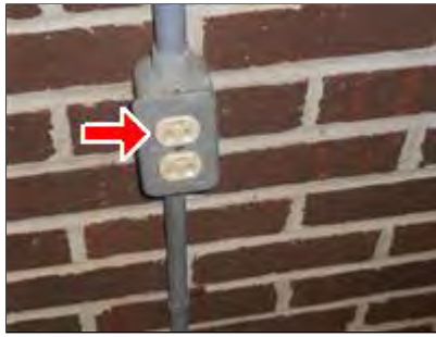
6.3 Picture 3

(3) The outlet at the rear deck is missing a weatherproof cover. Have cover installed for safety.