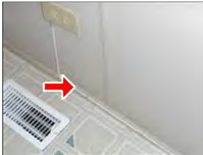
6.3 Picture 2

(2) There is an extension cord that is being used to extend an outlet. The wiring needs to be corrected and installed in conduit. This is a safety issue that needs to be corrected by a qualified electrician.