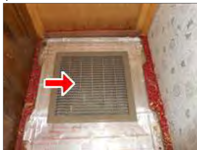
7.3 Picture 1

(1) The disposable filter is clogged and is dirty. The filter needs to be replaced. I recommend repair or replace as needed using a qualified person. There are two filter returns in the floor, one in the hall closet and one in the kitchen.