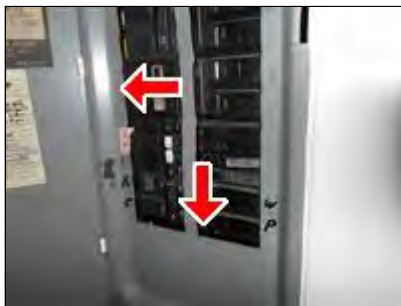
6.1 Picture 2

(2) The panel cover does not fit securely to the panel box. The trim is holding the cover away from the panel box, leaving gaps at the breakers. Have the trim notched to allow the cover to fit securely against the box.