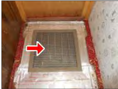
7.3 Picture 1

(1) The disposable filter is clogged and is dirty. The filter needs to be replaced. I recommend repair or replace as needed using a qualified person. There are two filter returns in the floor, one in the hall closet and one in the kitchen.