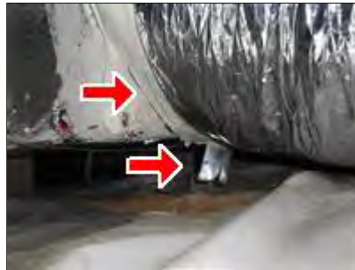
7.3 Picture 3

(2) There is duct tape that is pulling loose at the main duct in the crawlspace. This may lead to lose of heat or cold air. Have the duct properly sealed by a qualified person.