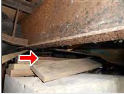
4.0 Picture 1