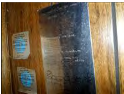
3.1 Picture 1

The identification tags for the mobile home are located in the bedroom closet. This is for you information.