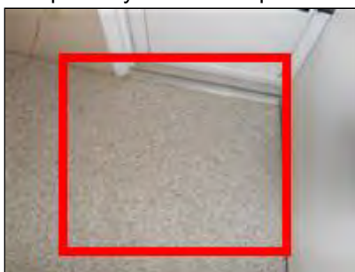
3.2 Picture 1

The flooring at the front door area feels soft. Unable to determine if there is damage underneath to the subfloor, the area underneath in the crawlspace is covered with netting. The under side of the subfloor is not visible. Have a qualified contractor evaluate if concerned. Carpet may need to be pulled back to assure the soundness of the subfloor.