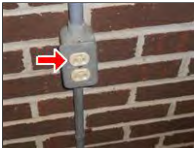
6.3 Picture 3

(3) The outlet at the rear deck is missing a weatherproof cover. Have cover installed for safety.