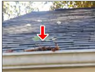
1.3 Picture 2

The roof of the home was inspected and reported on with the above information. While the inspector makes every effort to find all areas of concern, some areas can go unnoticed. Roof coverings and skylights can appear to be leak proof during inspection and weather conditions. Our inspection makes an attempt to find a leak but sometimes cannot. Please be aware that the inspector has your best interest in mind. Any repair items mentioned in this report should be considered before purchase. It is recommended that qualified contractors be used in your further inspection or repair issues as it relates to the comments in this inspection report.