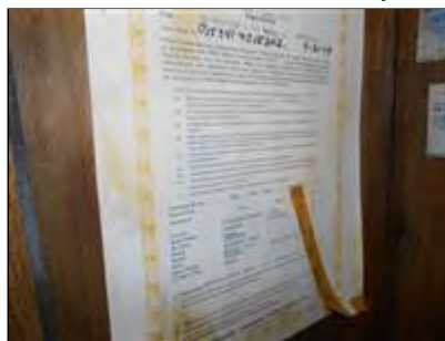
3.1 Picture 2