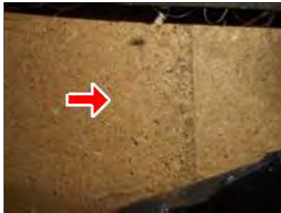
8.1 Picture 2