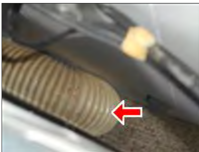
8.4 Picture 1

Recommend replacing the vinyl dryer duct with rigid or flexible metal duct. This is for your information.