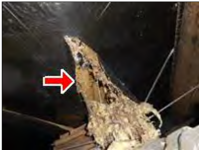
8.1 Picture 1

There are several areas where the insulation is damaged or missing in the crawlspace. Have a qualified person repair or replace the damage or missing insulation as needed. There is a section of the old vent duct that is exposed as well. Have the duct sealed and the area insulated.