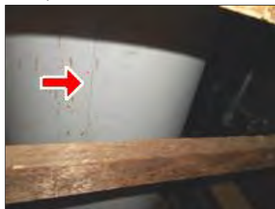
5.2 Picture 1

The water heater is located behind a panel in the bedroom closet. Full inspection was not performed due to the location. Further evaluation may be desired after owners personal items are removed from the closet.