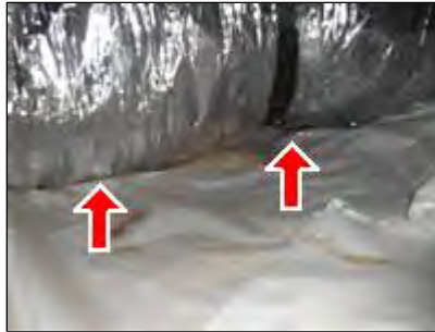
7.3 Picture 4

(3) The main duct is laying on the ground in the crawlspace. This may lead to deterioration of the duct. Recommend having the duct secured to raise the duct from ground contact.