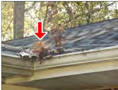
1.3 Picture 1

The gutters are full of debris in areas and needs to be cleaned. The debris in gutters can also conceal rust, deterioration or leaks that are not visible until cleaned, and I am unable to determine if such conditions exist.