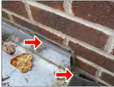
7.0 Picture 1

(2) There is evidence of rust and debris at the gas pack furnace vent. Have the unit serviced by an HVAC contractor to evaluate the burner and heat exchanger area of the unit.