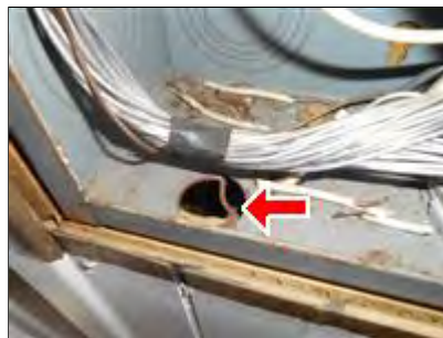
6.1 Picture 1

(1) There is knock out missing in the bottom of the electrical panel box. This has created a hole that needs to have a plug installed. This is a safety issue that needs to be corrected by a qualified person.