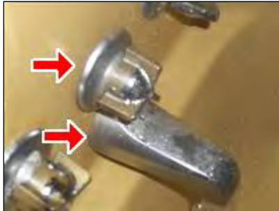
5.1 Picture 1

Have the area around the tub spout and backing plate where it meets the wall at the bathroom, caulked and sealed. Have a qualified person, caulk and seal the spout to eliminate possible water intrusion.