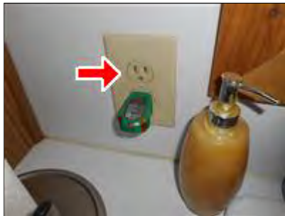
6.3 Picture 1

(1) The electrical outlet at the left of the kitchen sink has an open ground and is wired improperly. This is a safety issue that needs to be corrected. Have a qualified electrician repair as needed.