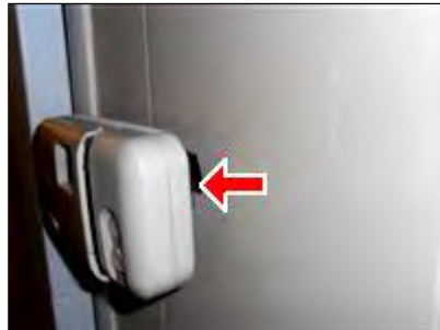
7.1 Picture 1

The thermostat is mounted to the wall with spacers. Have blocking installed to properly secure the thermostat.