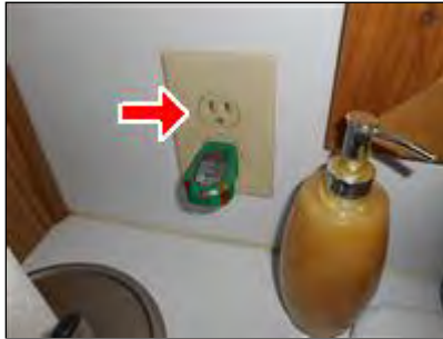
6.3 Picture 1

(1) The electrical outlet at the left of the kitchen sink has an open ground and is wired improperly. This is a safety issue that needs to be corrected. Have a qualified electrician repair as needed.