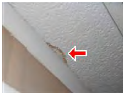
3.0 Picture 1

The Ceiling Tile on the ceiling reveals a light stain which appears from a water leak. Stain appears old at the hallway. This is a cosmetic issue for your information. I recommend repair as desired.