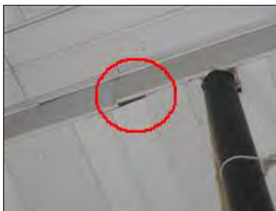
2.5 Picture 1