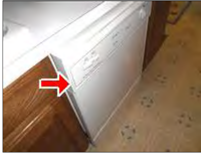
9.0 Picture 1

The dishwasher would not properly drain during operation. Have dishwasher evaluated by a qualified person and repair as needed.