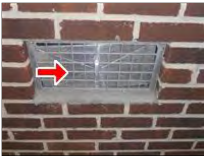
8.3 Picture 1

Recommend opening the foundation vents in the early spring and close in the late fall.