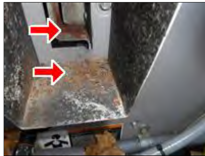
7.0 Picture 2

(2) There is evidence of rust and debris at the gas pack furnace vent. Have the unit serviced by an HVAC contractor to evaluate the burner and heat exchanger area of the unit.