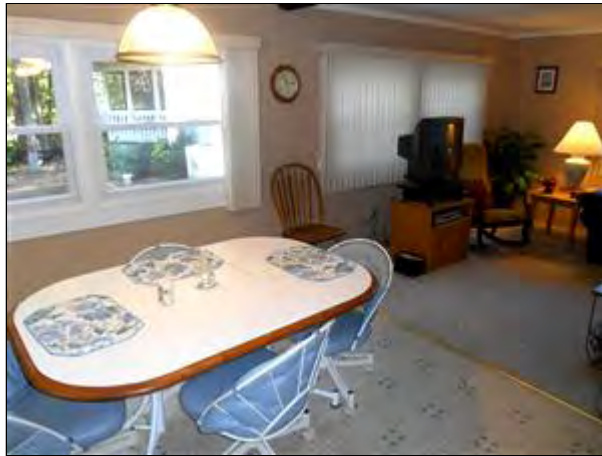
Dining Room Styles & Materials