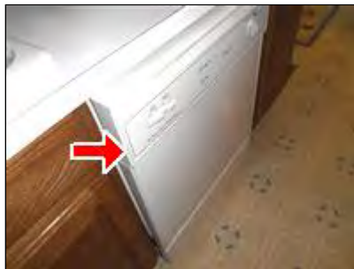
9.0 Picture 1

The dishwasher would not properly drain during operation. Have dishwasher evaluated by a qualified person and repair as needed.