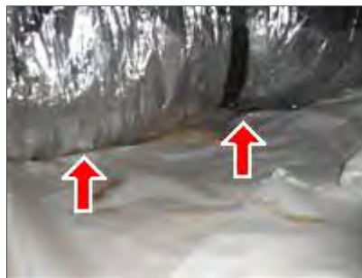
7.3 Picture 4

(3) The main duct is laying on the ground in the crawlspace. This may lead to deterioration of the duct. Recommend having the duct secured to raise the duct from ground contact.