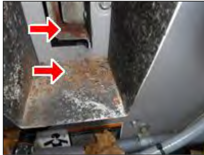
7.0 Picture 2

(2) There is evidence of rust and debris at the gas pack furnace vent. Have the unit serviced by an HVAC contractor to evaluate the burner and heat exchanger area of the unit.