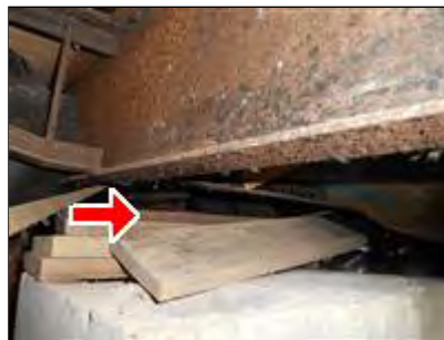
4.0 Picture 1

The wood shims at the structure in the crawlspace are loose and are not properly supporting the structure. Have the shims properly installed.