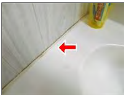
3.4 Picture 1

Have the area at the side splash in the bathroom caulked and sealed to eliminate possible moisture intrusion.