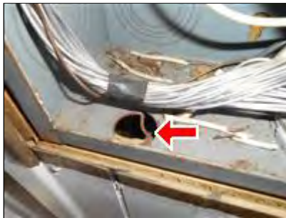
6.1 Picture 1

(1) There is knock out missing in the bottom of the electrical panel box. This has created a hole that needs to have a plug installed. This is a safety issue that needs to be corrected by a qualified person.